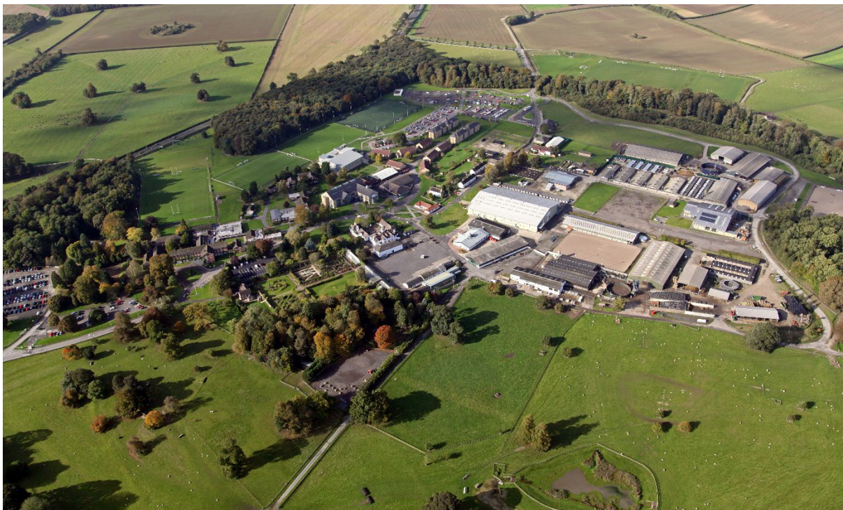
Figure 3 Aerial View: Bishop Burton Campus

Hull & East Yorkshire Collaborative Annual Accountability Statement (Appendix B)