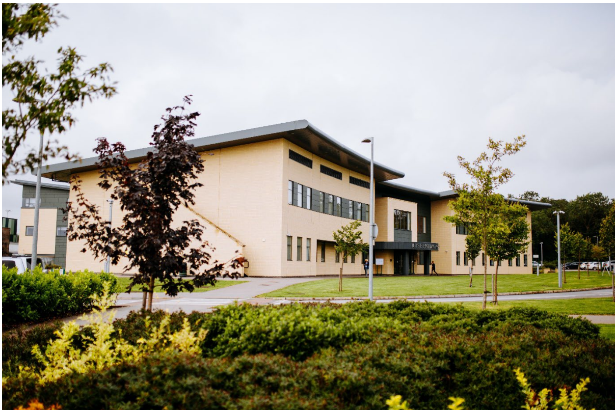
Figure 2 Riseholme College Campus

Other educational institutions were consulted on LSIPs via a number of regional Principals' meetings with draft Accountability Statements being shared to identify gaps in provision and areas of overlap. This approach has been extended for the 2024/25 Accountability Statement, with providers working together to produce the Shared Statement for Greater Lincolnshire (Appendix A) and Hull & East Yorkshire (Appendix B), identifying how providers within the LSIP areas are collaborating to meet local and regional skills priorities.