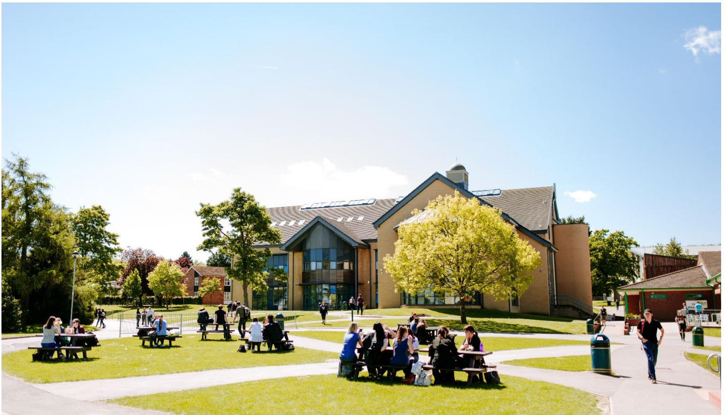
Figure 1 Bishop Burton Campus